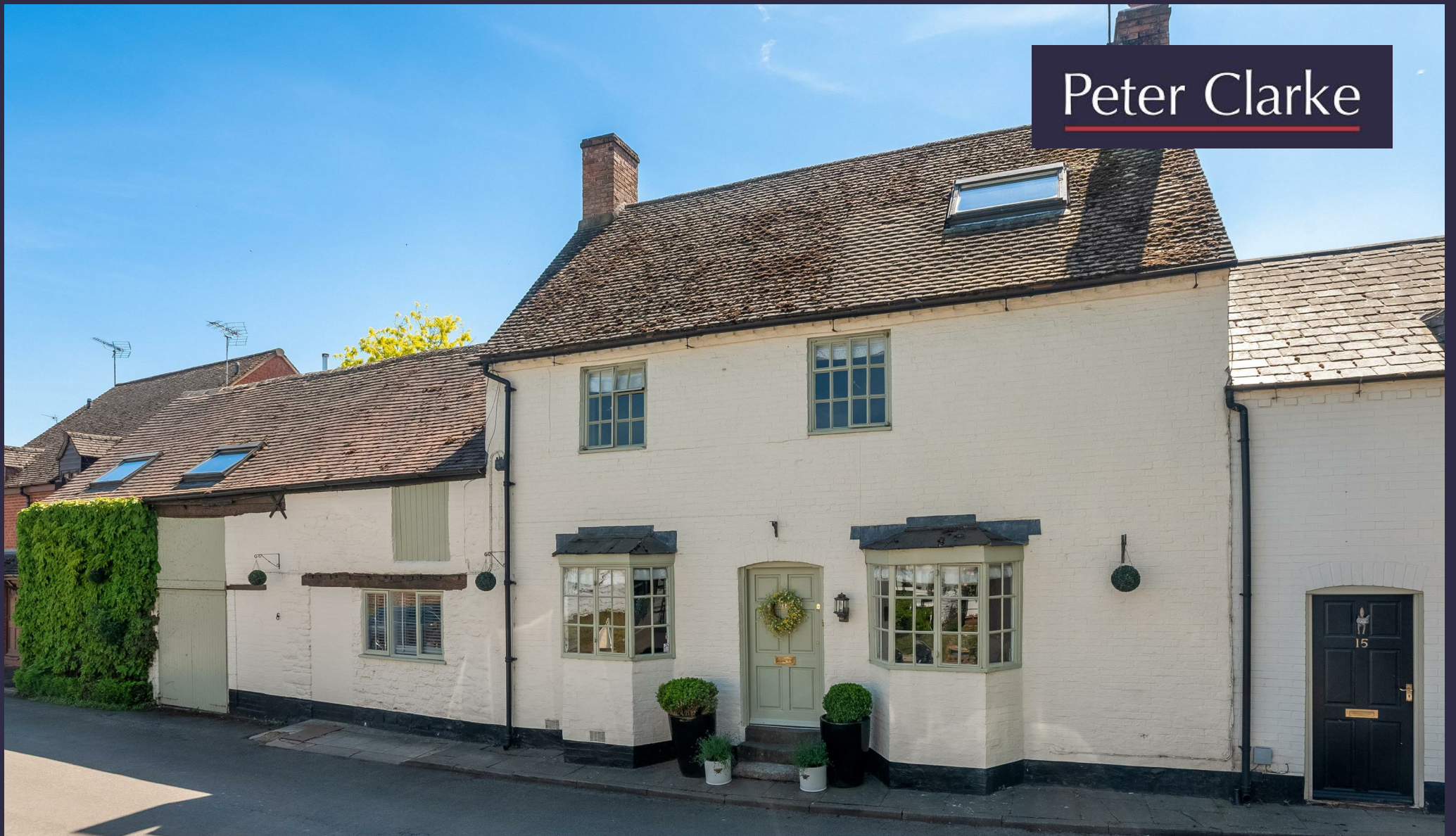
Stour House, 11 Watery Lane, Shipston-On-Stour, Warwickshire, CV36 4BE